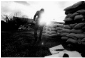
page 146 Max piling sandbags at Macon's construction supply depot