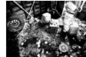
page x Felix muscling in the abandoned shack in the alley behind the corner store