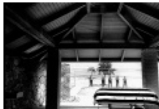
page 293 Carter's military burial