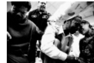
page 258 Carter and Tina receiving the Holy Ghost at Crystal's evangelical church