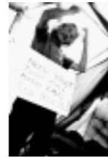
page 169 Hank preparing for a day of panhandling