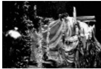
page 168 Christmas at Hank and Petey's camp