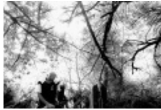
page xxii Hank muscling in his camp following his early release from the hospital