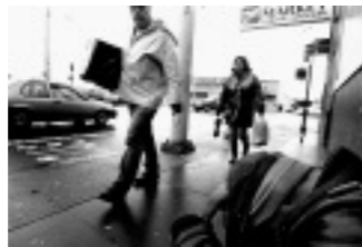
page 20 Felix nodding by the A&C corner store