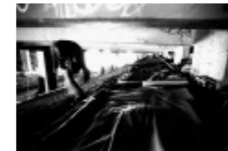
page xvi Frank in a temporary camp under the freeway overpass