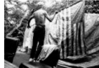
page ii Hank raising the American flag at the new white camp