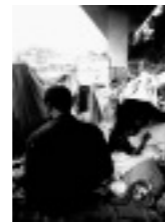
page 61 Early morning at the I-beam camp