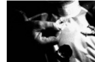
page iv Black tar heroin, rigs, and cooker