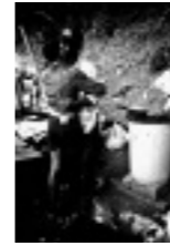
page 62 Cooking dinner