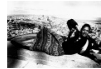
page 72 Tina at Twin Peaks, posing for a picture for her mother on Mother's Day