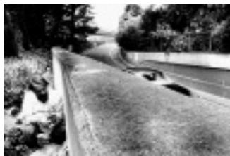
page 2 Frank injecting in the hole