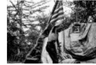
page 216 Hank positioning the flag next to Jeff's Thanksgiving barbecue group portrait