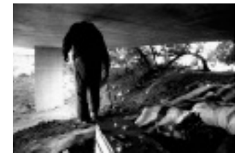
page 86 Hogan leaving camp