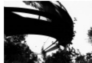
page viii Under the pedestrian ramp crossing the two freeways