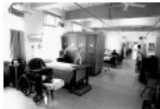
page 312 Max in the city's long-term hospice for the chronically ill and indigent