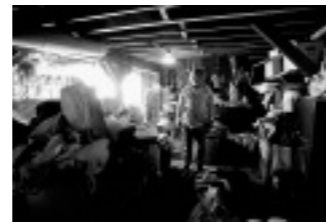
page 298 Hogan in Paul's garage