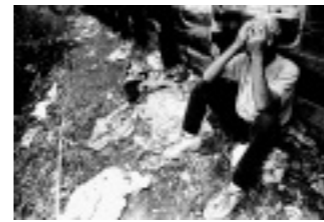
page 78 Hank, dopesick, by the freeway retaining wall