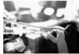
page 231 Petey in intensive care for liver failure