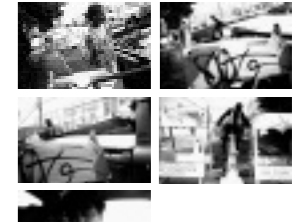
pages 74-75 The road crew lick