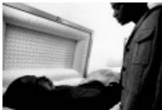
page 291 Carter's viewing in the funeral home