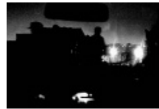
page 250 Carter and Tina hitting a lick at a construction site